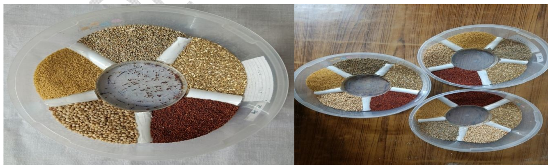
Plate 1 : Layout for Host preference

Under Free Choice Test, 100g seed of each millet was kept in a round plastic container which is equally partitioned in trough equidistance from centre. Approximately 50 pair of rice weevil were released in the centre of container giving free choice to the adult for orientation and then container covered with muslin cloth. The Experiment was replicated 3 times.