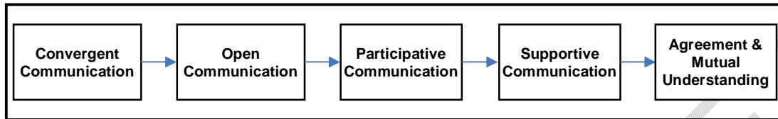
Figure 4. Recommendations of Communication Models in Managing Geothermal Power Plant Conflict in Serang Regency, Indonesia.

with the given information failed, a confrontational communication approach was taken, which involved bringing in officers to forcefully enter the Geothermal Power Plant permit area and attempting to damage the guardrails constructed by the residents. Residents no longer trust the company and therefore reject it, refer to Figure 4.