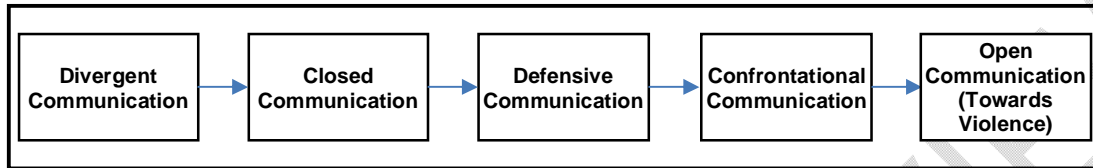
Figure 3. Communication Model in a Conflict of Geothermal Power Plant in Serang Regency

interest in supporting the construction of the Geothermal Power Plant in Padarincang. The company's divergence communication approach puts citizens, as constituents, in a position of unequal importance and obliges them to accept information given by the company, causing discomfort among citizens.