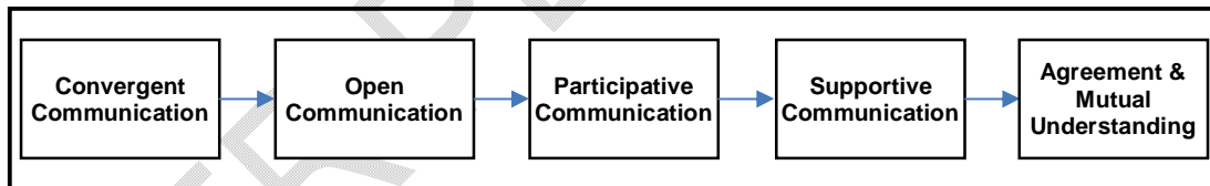
Figure 4. Recommendations of Communication Models in Managing Geothermal Power Plant Conflict on Mount Prakasak, Serang Regency.

The company supports its stance on the information given by using experts to validate it, which may include defensive communications. After their attempts to persuade the residents with the given information failed, a confrontational communication approach was taken, which involved bringing in officers to forcefully enter the Geothermal Power Plant permit area and attempting to damage the guardrails constructed by the residents. Residents no longer trust the company and therefore reject it, refer to Figure 4.