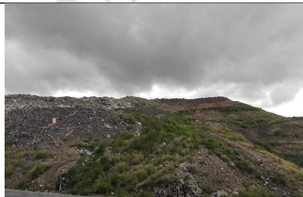
Fig .1A mountain of trash with dirt and leachate on top.