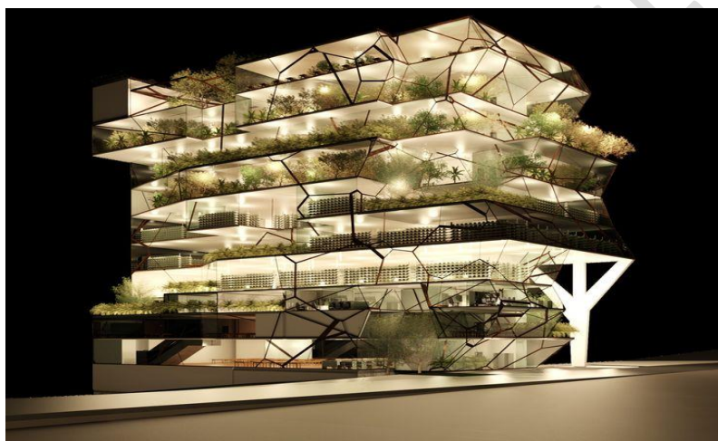
Fig 3. Vertical farm in Sao Paulo, Brazil

Agriculture in India is constantly threatened by land degradation, desertification, and extreme weather conditions such as floods and droughts. The population in India is increasing rapidly. It is predicted that India will have up to 25 per cent more population in 2036. The vegetation in India is similar to that in Africa or Kenya. Above all, the droughts are causing problems for the farmers. In addition, more and more people are moving to cities, where the pressure for food increases.