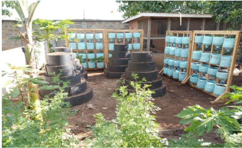
Fig. 2. Vertical farm in Africa

needs to be done a lot of research on the vertical farming technology and also, it's disadvantages. Also there has to be a calculation with the cost that vertical farming brings with it.