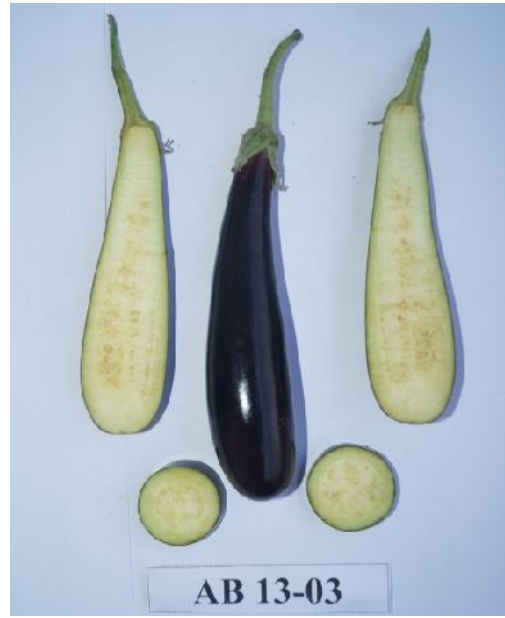
Figure: 1 Fruits and its Cross section view of AnandDoli