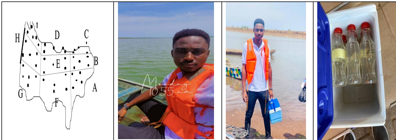
Plate 1. Water Sampling in the Reservoir of the Bontanga Irrigation Dam

strata and five (5) Sampling Points were purposively selected (Plate 1). Five (5) samples were collected from each stratum and were combined (composited) to give one sample each in each stratum reducing the number of samples from forty-five (45) to nine (9) (Plate 1). The sampling began at the lower section, then to the middle section, and finally to the upper section or the receiving point. The sampling was done in this way to avoid contamination or mixing of particulate matter from the upper section. Also, a field blank consisting of deionized water was added to the samples. To identify errors and contamination during sample collection and analysis, the pH and temperature of the samples were measured at the University of Ghana's Ecological Laboratory prior to statistical analysis. The nine (9) samples were carefully labelled using permanent marker and stored in an ice chest with ice cubes. The ice chest was securely sealed shut using duct tape. The samples were kept at approximately 4°C and transported to the Ecological Laboratory of the University of Ghana for analysis of 17 parameters including 3 physical parameters and 14 other nutrient and chemical parameters.