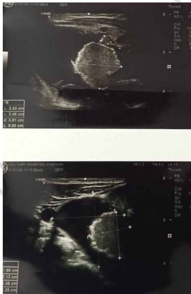
Fig.1 – Ultrasonography of the right lobe thyroid showing a solid and cystic

In conclusion, DSV of PTC represents a rare and distinct variant of thyroid cancer characterized by diffuse sclerosis and unique histopathological features. Although it poses diagnostic challenges due to its rarity and overlapping characteristics with other thyroid neoplasms, a comprehensive approach incorporating histopathological evaluation, immunohistochemistry, and molecular testing is essential for accurate diagnosis and optimal management. Further research is warranted to elucidate the molecular mechanisms driving DSV and identify novel therapeutic targets for this rare variant of PTC.