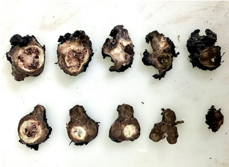
Fig.2 – Serial sections of the right hemithyroidectomy specimen showing an ill circumscribed solid and cystic lesion with areas of necrosis

lesion(TIRADS 4). The hypoechoic nodule with wall calcification and punctate echogenic foci.