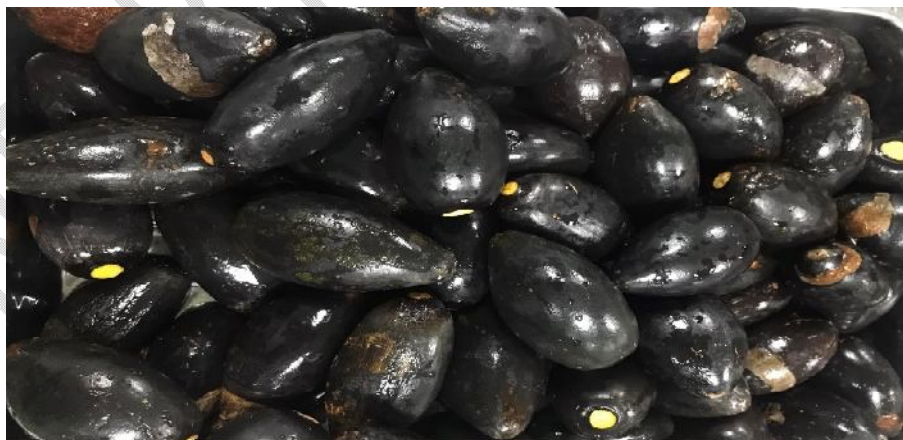
Figure 2. Canarium ovatum Engl. (Pili) Pulp

Maturities of pili was determined by the change of exocarp color from green to dark purple or black(Millena et al. , 2023). The collected pili fruit were washed with distilled water and boiled it for 10 minutes in 70°C. The fruit were peeled and separate from the pulp. The pulp was dried in an oven for 80 °C for 3 hours. Then, it was finely pulverized using an electric blender. The powdered fruit pulp underwent a maceration process in a solvent (1:6 w/v ratio). Subsequently, the macerated mixture was filtered using filtration process to eliminate the residue which the remaining extract was subjected to simple distillation within a temperature range 50°C-60°C and then incubated for 1-hour aiding in the evaporation of any residual alcohol content.