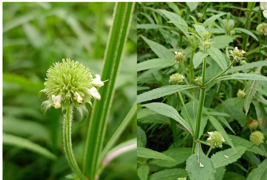
Figure 2. Hyptis capitata Jacq. leaves and its flower

temperature in order to remove the remaining alcohol presents in the sample. The flowers of Burunganon flower crude extract are collected and refrigerated until use.