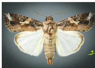
Figure 66. Fall armyworm adult male