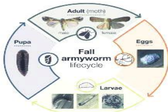
Figure 14. Fall armyworm lifecycle.

The life cycle of this pest completes in up to 30-90 days (30 days in summer, days in spring, and 80-90 days in winter) (Capinera, 2002). According to JL Capinera, 2002, this pest has up to 4 generations in its life cycle these generations are observed at-in different places like-as in New York it shows a single generation, in Kansas, two-generation was reported and in South Carolina, three-generation was observed, and in Louisiana, the four generations of this pest have been founded.