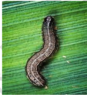
Figure 33. Fall armyworm larva

Larvae are a light green to dark brown colour with a longitudinal strip. During the 6th instar, this larva becomes 4.5cm long. The mature larvae have a white inverted “Y” shaped mark on the front of its epidermis that is a rough granular in texture (Prasanna et al. , 2018). The larvae have eight prolegs and the final pair of the prolegs within the last abdominal segment (CABI, 2019). At the time of hatching these larvae are seen as green colour with black lines and spots on the upper body, as they grow either remain green colour or become buff-brown and have a black dorsal spiracle line (Sagar et al. , 2020). The newly hatched larvae are burrowing in nature (CABI, 2017). According to Capinera, 2000 the 1-6instar larvae have a head capsule with different diameters like 0.35, 0.45, 0.75, 1.3, 2.0, 6.4, 10.0, 17.2 mm and the length of the full-body are about to 1.7, 3.5, 6.4, 10.0, 17.2, 34.2 mm respectively. At the sixth instar, the colour of larvae is nearly black and this phase is known armyworm phase. (Rwomushama, 2019). The larvae of the autumn army contain 6 instars cycles but occasionally five.