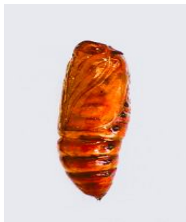
Figure 44. fall armyworm pupa