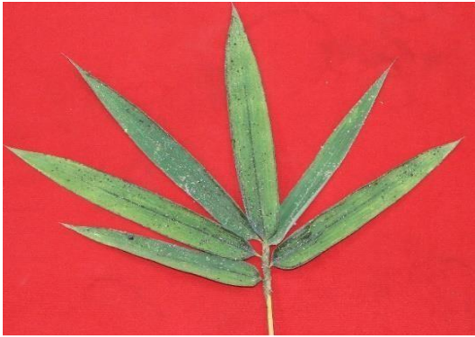
Fig. 2. Aphid infested leaves