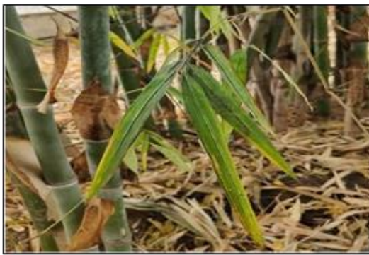
Fig. 4. Aphid infested bamboo plant