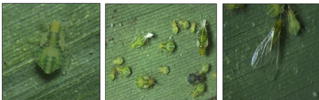
Fig. 1. Adult bamboo aphid, A. bambusae under SMZ800N microscope

Adult female was apterous, broadly pear shaped, small in size and yellowish green or pale green in colour. Antennae were very long, thread and pointed at the tip. They varying in markings, with one form having two dark green uninterrupted longitudinal stripes. Alternatively, they may have two separate pairs of short green stripes, the first stripe runs from thorax to abdominal tergite I and the second from tergites V to VII. Thorax was narrow, wax is sometime present as a fringe at the margin of head and usually in tufts around the thorax and abdomen. Eyes small, black, having 3 facets. Siphuncle were very small, pale placed on dark sclerite surrounded by 8-10 long hairs (Fig. 1).