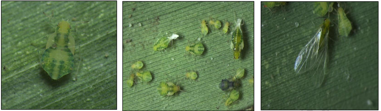
Fig 1: Adult bamboo aphid, A. bambusae under SMZ800N microscope