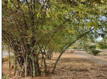
Fig 4: Aphid infested bamboo plant