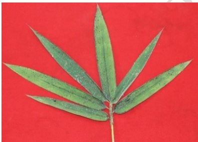
Fig 2: Aphid infested leaves

During the observation, the infestation of A. bambusae was noticed on bamboo in the month of November 2023 to March 2024. Bamboo aphid cause damage mainly to the leaves. Colonies of light green to yellowish green and broadly pear shaped aphids were observed on the underside of leaf blades of D. strictus plants. Both adults and nymphs suck the cell sap from the lower surface of bamboo leaves and tender shoots in young plantations. Upper side of infested leaves were covered with sticky substance (Fig. 2 and 3). The honeydew produced is deposited on the bamboo leaves which encourages the growth of sooty moulds. The infested leaf blades bore pale look and had dry streaks inside and on margins with dry lumpy patches that extended from center to the leaf margins or vice versa (Fig. 4). Adults and nymphs fed gregariously on the lower surface of the leaves.