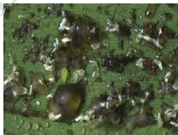
Fig 3: Leaves covered with sticky excrete