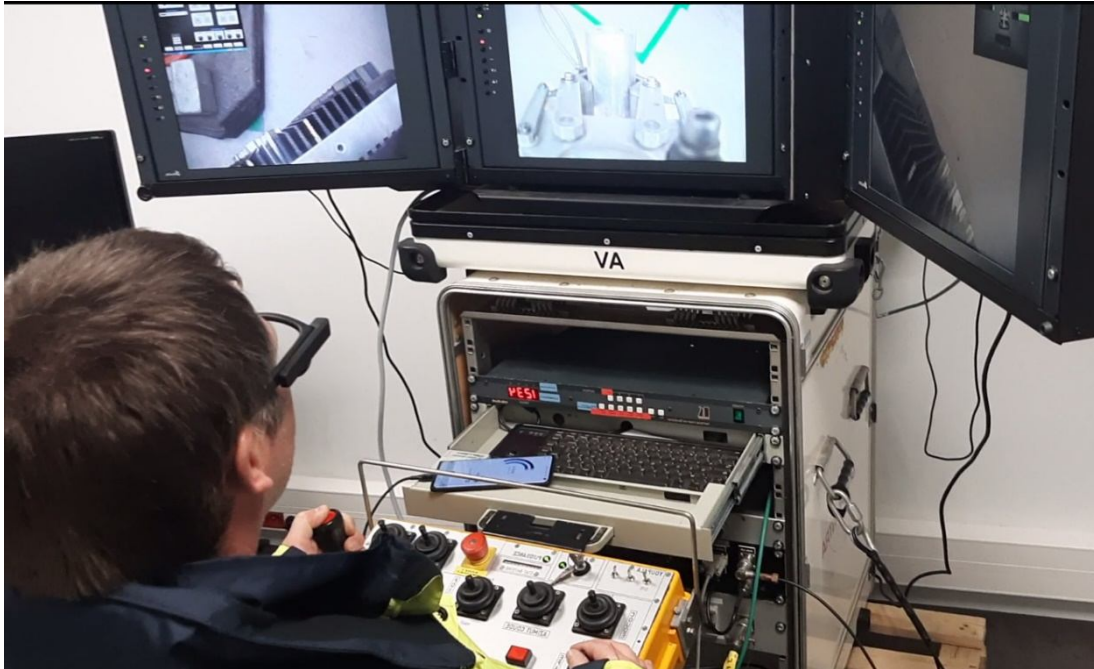
Fig. 5. A pilot in front of the control console whilst teleoperating the robot: the screens provide views provided by the robot on-board cameras