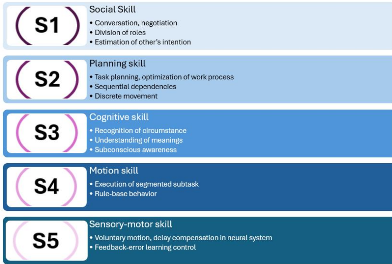
Fig. 1. Hierarchical classification of skills in mechatronics teleoperation by [22]

identify the classes that might be improved in the training program. The hierarchical classification of competencies identifies 5 schematized classes: Fig. 1.