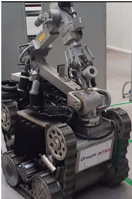
Fig. 4. Front view of the robot with the container in the gripper

The pilot was installed at the control desk consisting of a control console with buttons and joysticks, multiple screens associated with each of the on-board cameras, and a keyboard to adjust the zoom of certain cameras (Fig. 5).