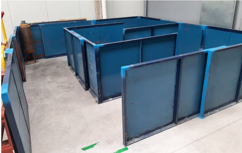
Fig. 3. Overview of the maze used during the study: the teleoperated robot must move through the maze and, half-way, pick up a ring

had to be picked up with the gripper of the articulated arm, then dropped into the container, then the container had to be picked up to get out of the maze. This activity was carried out in a full-scale simulator in order to reduce the risks associated with the safety of people or the safety of equipment. For this reason, the recommended risk analysis prior to the use of subjective cameras [23,24] was not applied in this study.