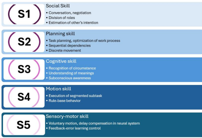
Fig. 1. Hierarchical classification of skills in mechatronics teleoperation by [22]

“The hierarchy consists of the following skills: social- (S1), planning- (S2), cognitive- (S3), motion- (S4) and sensorymotor (S5) skills. The S5, a sensory-motor skill, is the lowest and relates mainly to voluntary motion. This skill concerns cooperation between the neural system and the musculo-skeletal system inside the human body. S4 (motion skill) relates to the continuous execution of each body part motion. For example, the sequential execution of finger, hand and arm motions when using a hand tool. S3 is cognitive skill. This mainly concerns recognition of circumstance and includes a wide range of cognitive issues, such as the understanding of meanings. S2 (planning skill) relates to understanding a whole task process and recognising sub-tasks within the whole task. This skill also relates to the task management of subtasks, which requires consideration of events' causality and time scheduling. S1 is social skill, which relates to communication, conversation, negotiation and the estimation of other intentions” [22:2].