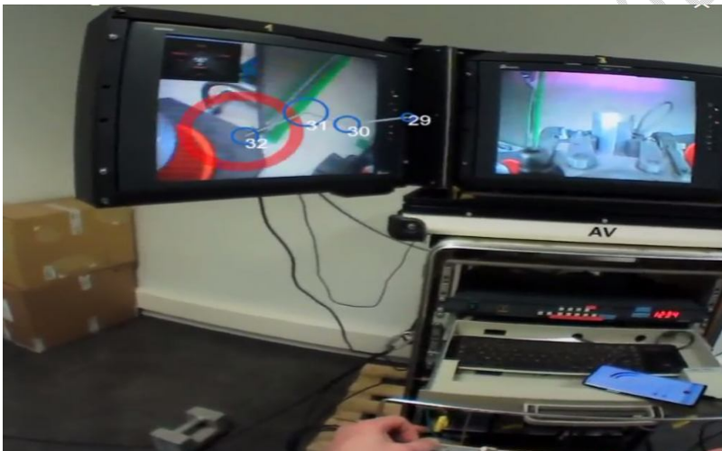
Fig. 5. Screenshot of the eye-tracking video recording and localization of the gaze (red circle) and fixation points (blue circles)

Comment [HR10]: Header for the column is missing.