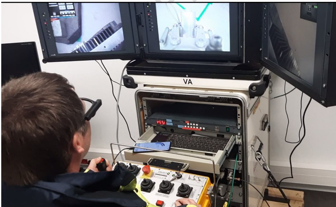
Fig. 4. A pilot in front of the control console whilst teleoperating the robot

The pilot was installed at the control desk consisting of a control console with buttons and joysticks, multiple screens associated with each of the on-board cameras, and a keyboard to adjust the zoom of certain cameras (Fig. 4).