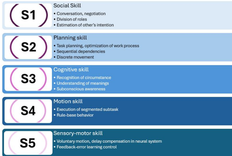
Fig. 1. Hierarchical classification of skills in mechatronics teleoperation by [22]

“The hierarchy consists of the following skills: social- (S1), planning- (S2), cognitive- (S3), motion- (S4) and sensorymotor (S5) skills. The S5, a sensory-motor skill, is the lowest and relates mainly to voluntary motion. This skill concerns cooperation between the neural system and the musculo-skeletal system inside the human body. S4 (motion skill) relates to the continuous execution of each body part motion. For example, the sequential execution of finger, hand and arm motions when using a hand tool. S3 is cognitive skill. This mainly concerns recognition of circumstance and includes a wide range of cognitive issues, such as the understanding of meanings. S2 (planning skill) relates to understanding a whole task process and recognising sub-tasks within the whole task. This skill also relates to the task management of subtasks, which requires consideration of events' causality and time scheduling. S1 is social skill, which relates to communication, conversation, negotiation and the estimation of other intentions” [22:2].