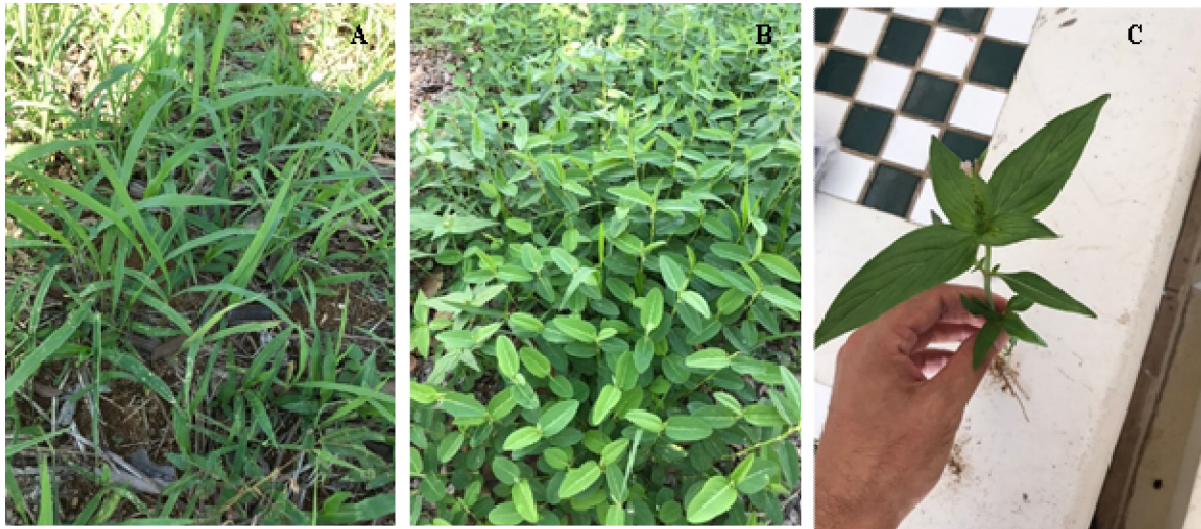
Figure 1. Weed species in the studied area and which germinated in the control: A - crabgrass ( Digitaria horizontalis ), B - forage peanut ( Arachis pintoï ) and C - roundworm ( Spigeliaanthelmias ).

In treatments with concentrations below 3%, the pyroligneous liquor was not efficient in inhibiting germination, indicating that the occurrence of germination decreases as a result of the increase in the dosage of the pyroligneous liquor compared to the control group (Figure 2).