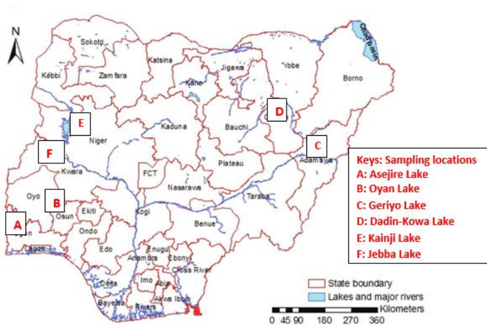
Figure 1. Map of Nigeria showing the study locations

Jebba Lake: The lake lies between longitude 04°30' to 04°50' E and latitude 09°55' N. It has a drainage basin extending from Kainji Reservoir to the Jebba area (approximately 100 km). The six major rivers that empty into the lake are Oli, Wuruma, Moshi, Awuru on the western side and Kontangora and Eku on the Eastern part (Adesina et al. 2007).