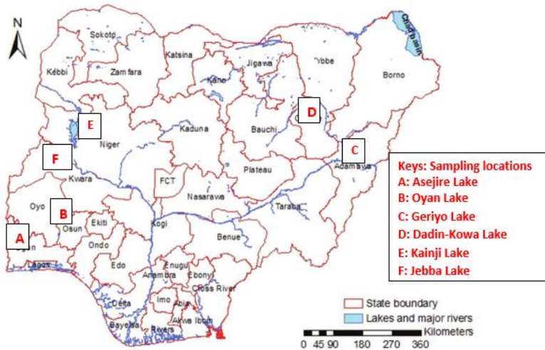
Figure 1. Map of Nigeria showing the study locations

The study areas include six (6) lakes among the major lakes in Nigeria. These include Asejire (07°2'N, 04°7'E) and Oyan (7°15'N, 3°16'E) Lakes from the Southwestern Nigeria; Kanji (10°22'N, 4°33'E) and Jebba (9°8'N, 4°47'E) Lakes from the Northcentral of Nigeria; and Lake Geriyo (9°8'N, 12°25'E) and Dadin-Kowa (10°8'N, 11°32'E) lakes from the Northeastern Nigeria as shown in Figure 1.