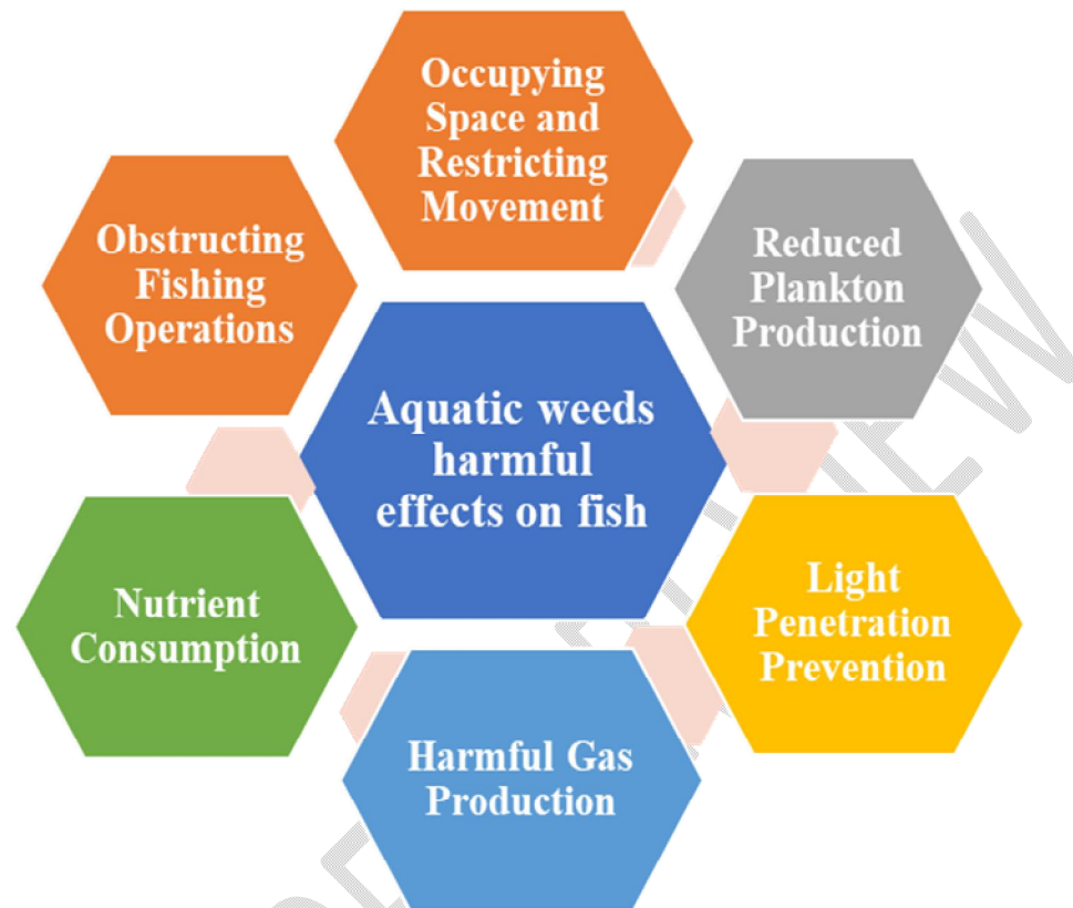
Fig: 1. Aquatic weeds can harmful effects on fish.

oxygen depletion caused by bacteria can further exacerbate the situation, impacting fish survival (Oh et al. , 2023).