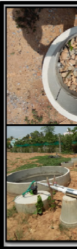
Fig 2: Field es