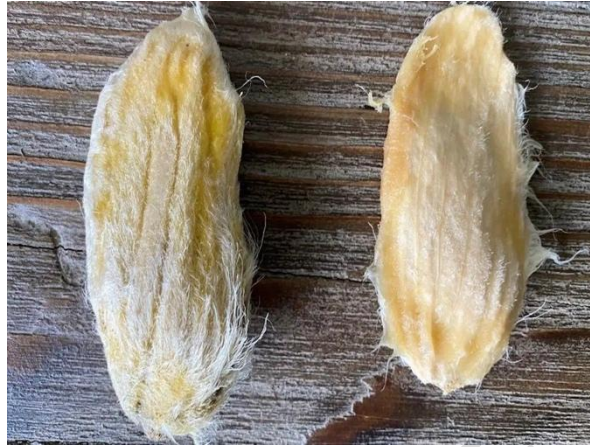
Figure. 4. Mango Seeds 4

process, the mixture is carefully squeezed and filtered, after which it is left undisturbed for 24 hours. The sediment, rich in phytate, is separated and subjected to drying in an oven set at 30°C for a duration of 12 hours [16]. This comprehensive procedure ensures the efficient extraction of starch from mango seeds, establishing a viable source for the production of bioplastics.