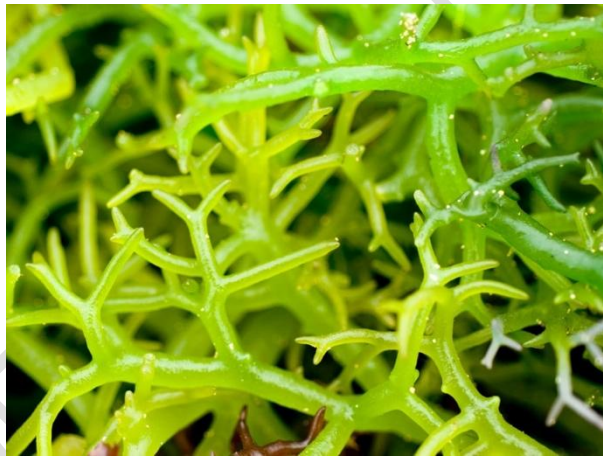
Figure. 11. Kappaphycusalvarezii 10

For alginate extraction from Sargassum sp., 100 grams of samples are soaked in 1% HCL for 1 hour, washed with fresh water until the pH is neutral, and then extracted with a 3% Na 2 CO 3 solvent (3 liters, 1:30 w/v) at 60°C-70°C for 2 hours. The filtrate is treated with 4% NaOCl (1 liter, 1:2 v/v) to induce alginate gel formation. Alginic acid conversion is achieved by adding 5% HCl while stirring until alginate gel forms. The resulting alginate fibers are filtered, washed with 1% NaOH until neutral pH, and then immersed in 3 liters of isopropyl alcohol (1:3 v/v) to create alginate fibers, which are then sun-dried and blended into powder [21].