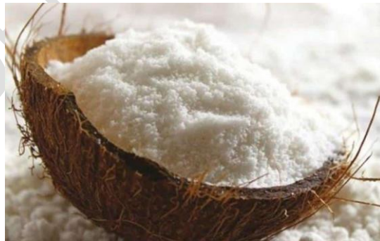
Figure. 6. Grated coconut pulp 6

Meanwhile, the variable volume of distilled water solvent (250 ml, 300 ml, 350 ml) is put into the extractor and heated to 50°C. After the temperature is reached, 100 mesh coconut pulp (the best result before) is added and extracted at 50°C with a magnetic bar stirring speed scale 6. After 5 hours of extraction, the solution is filtered using a filter cloth to separate it from coconut pulp. The solution is then put into a glass cup, and methanol is added to separate the galactomannan from water. After forming two layers, they are separated using a separating funnel. The galactomannan obtained is dried with an oven at 60°C. The dried galactomannan is weighed to determine the best solvent volume [8].