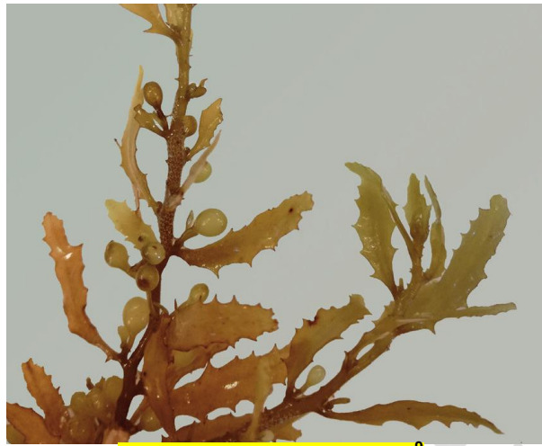
Figure. 10. Sargassum sp. 9