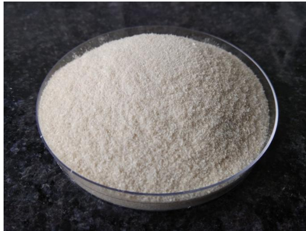
Figure 12. Chitosan 11

Chitosan (Figure 12), a biopolymer derived from the deacetylation process of chitin, is typically extracted from crustacean shells, such as those of crabs and shrimps, as well as from the cuticles of insects, fungi, and even fish scales [23]. Functioning as a reinforcement, chitosan plays a crucial role in enhancing tensile strength and elongation at break [24]. Its primary application lies in being an additive in bioplastic production, where it imparts several improvements. The hydrophobic, non-toxic, and biodegradable properties of chitosan contribute to the development of robust bioplastics with heightened water resistance. The inclusion of chitosan also augments the number of hydrogen bonds within the bioplastics, providing additional support to their structural integrity [23].