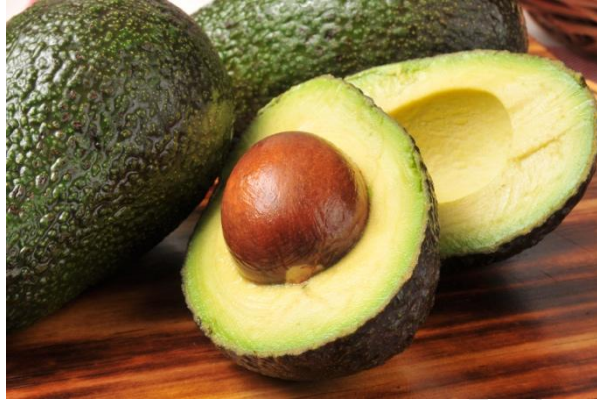
Figure. 2. Avocado Seeds 2

avocado seeds. The seed pieces are blended with distilled water, filtered using cloth, and left to stand for 24 hours. After discarding the precipitated water, the starch is washed, sun-dried, finely ground with a pestle and mortar, and sieved with a 100-mesh sieve. [15] employed a similar approach, soaking avocado seed slices in a sodium metabisulfite solution, forming a slurry, and allowing it to stand before drying the precipitate for 6 hours at 50°C.