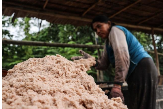
Figure 7. Sago dregs 7

material. The plant with the name Metroxylon has a starch content in the pith of the sago stem that varies according to age, type, and environment where it grows. The starch content will be greater the older the plant is, and will decrease at a certain age. Making starch from sago pulp can be done by cutting and grating the sago pith. Store in a container and add enough water. After that, filtering is done twice with different sieve sizes. Then precipitation, washing, and drying are carried out. Then cut into pieces, crushed and sieved with a size of 60 mesh, then 80 mesh. The results were weighed and put in a container [19].