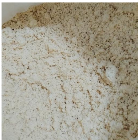
Figure. 9. Tofu Dregs 8

Tofu pulp (Figure 9), a by-product of tofu production, is rich in protein content, with dry tofu pulp containing 23.39% wt. of protein. Given its amino acid composition, soy protein from tofu dregs is an excellent choice for a bioplastic base material. The protein extraction process involves preparing dry tofu pulp, adding water (1:2), and using a strong base (2 N NaOH) for extraction for 1 hour. The extracted protein is then filtered twice to separate it from the residue.