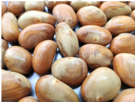
Figure. 3. Jackfruit Seeds 3

Jackfruit seeds (see Figure 3), weighing 100 grams and containing 40-50% starch, can be harnessed for biodegradable plastics. Ripe jackfruit seeds are processed by peeling, blending with water, squeezing, and allowing the squeezed material to stand for 24 hours to obtain starch sediment, which is then sun-dried [4].