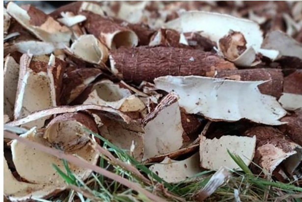
Figure. 1. Cassava Peel 1

Various methods have been explored to extract starch from cassava peels. In one study [10], 100 grams of cassava peels underwent a meticulous cleaning process and were then crushed with a blender using 100 ml of water to facilitate the extraction. The resulting cassava peel pulp underwent filtration, followed by a 30-minute settling period to separate the precipitate from the water. The precipitate, dried at 70°C for 30 minutes, yielded cassava peel starch for the production of biodegradable plastic films.