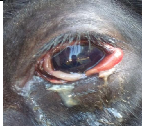
Fig.14: Conjunctivitis in left-eye of a buffalo. Note debris and discharge around the eyelids.