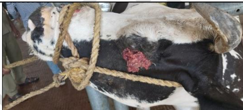
Fig.11: ocular growth with cauliflower appearance typically resembling OSCC in a cow. (Left-eye).