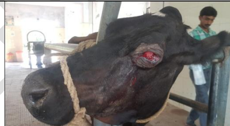
Fig.10: ocular growth with Pthisis bulbi in a cow. (Left-eye).