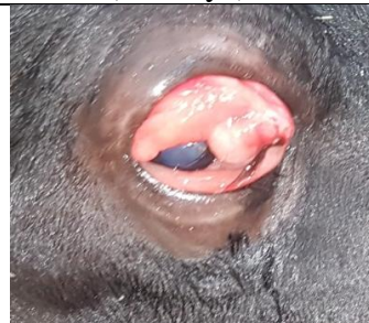
Fig.12: Chemosis and conjunctivitis in right-eye of a buffalo. Note globe is intact and cornea looks transparent.