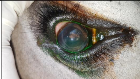
Fig.5: Uveitis in a cow. Note constricted pupil (Left-eye). Picture taken after FDT