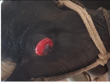
Fig.13: Exophthalmos, Chemosis and conjunctivitis in right-eye of a buffalo. Note globe is almost proptosed.