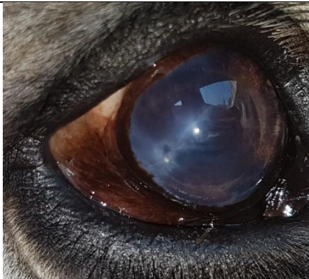
Fig.15: Corneal foreign body (Right-eye) in a cow, towards lateral canthus. Picture taken after retrieval of an embedded awn from corneal stroma. Note the lesion remained after treatment.