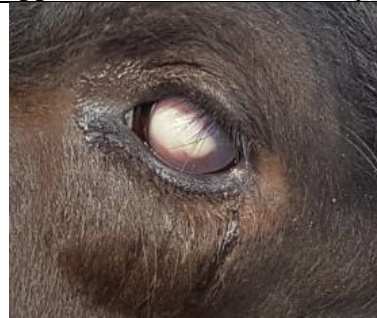
Fig.8: Hypopyon in a buffalo. (left-eye)