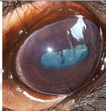
Fig.16: Mature cataract in right eye of bovine. (Note fundus is not visible).