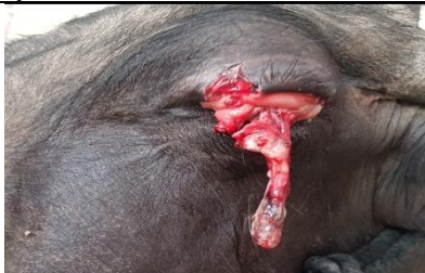
Fig.9: Upper eyelid laceration in a buffalo (left-eye involved).