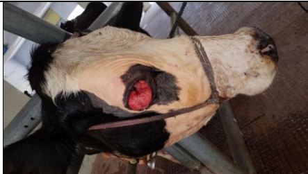
Fig.7: Ocular growth (upper eyelid and associated bulbar conjunctiva, Right-eye) in a HF.