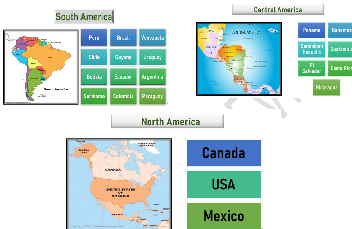
Fig 1 Countries selected for study in the American Continent

in the global forum. ITC HS Code (310210, 310221, 310230) were used in the study for deriving information regarding fertiliser trade to American country from India. To fulfil the specific objectives of the study based on the nature and extent of the availability of data, graphical representation, descriptive statistics (percentage) and tabular analysis were used in this study. A total 22 countries of American country were identified to know the fertilizer market and to know the scope of introducing new fertilizer products in the target countries 1 .