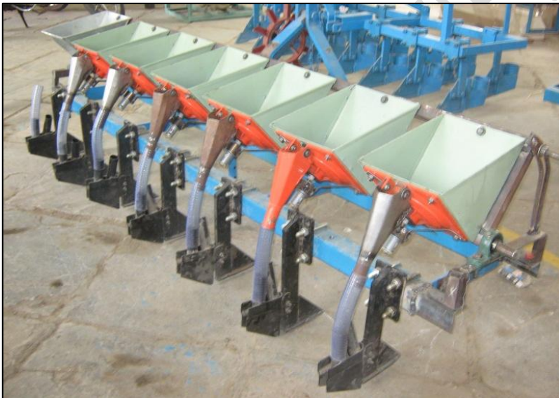
Fig. 3: Complete prototype unit of the seven rows electronic planter

ground level. The base frame of the hopper was 2100mm long, 270mm width and at a height of 75 mm from the main frame. Two pedestals were placed at the ends of the frame to give motion to the hopper unit for angle settings according to angle of repose requirements for various seeds. Shoe type furrow openers were used for further penetration. The tines are made of mild steel flat having width 45 to 65 mm and thickness 12 to 15 mm. Boot and tube are of mild steel sheet with minimum 1.60 mm thickness. Shoes are made of carbon steel with a minimum thickness of 4.0 mm. The inclined plate metering units were placed over each furrow opener to form the complete unit. The images of the complete unit are shown in Fig.3.