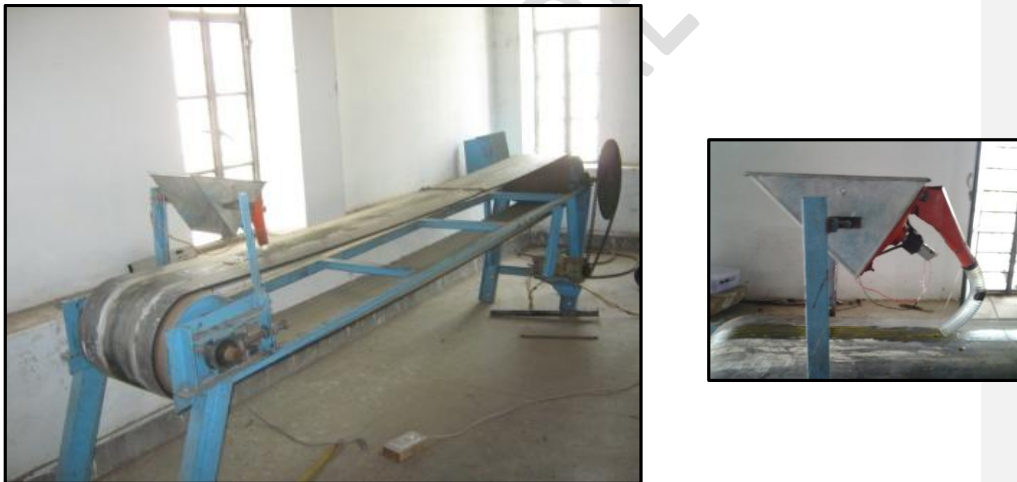
Fig. 2: Grease belt setup with opto- electronic sensor mounted on metering unit for laboratory testing.

The electronic metering unit was mounted over a grease belt 3555 mm long and the tests were carried out. The opto- electronic sensor was fitted in the seed tube just above it touches to the grease belt. The rollers were driven by a 1hp variable speed DC motor whose speed was varied to control the forward speed. The greased belt was driven at three speed levels of 2km/h, 2.5km/h and 3 km/h. The seed to seed spacing, seed rate and seed breakage were measured using grease belt as well as opto- electronic sensor system.