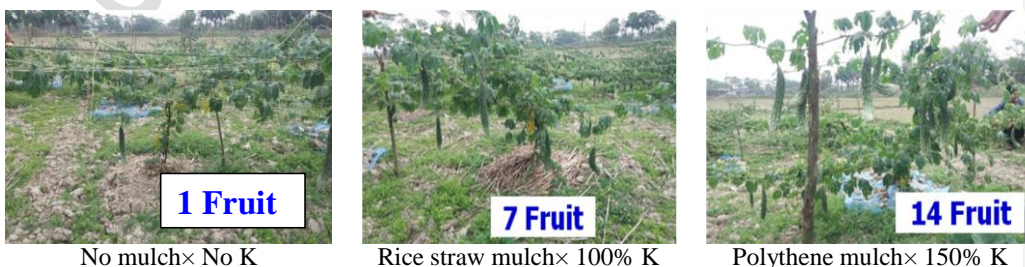
Fig. 1: Effect of mulching and K fertilization on number of fruits per plant at the time of first harvesting.

The number of fruits per plant varied significantly due to the single effect of mulch materials, K fertilizer and their interactions in both the years (2017-18 and 2018-19). Considering the single effect of mulch, the highest number of fruits per plant of 18.0 and 15.0 was obtained from polythene mulch in first and second year, respectively which was significantly higher than the rice straw mulch treatment. The lowest number of fruits per plant of 7.0 and 8.0 was recorded in no mulch treatment in first and second year, respectively. Considering the single effect of K fertilizer, the highest number of fruits per plant of 15.0 and 14.0 was obtained from 150% recommended K treatment in first and second year, respectively. In case of interaction effect, the highest number of fruits per plant of 23.0 and 19.0 was recorded in polythene mulch \times 150% recommended K fertilizer interaction in first and second year, respectively. The polythene mulch \times 100% recommended K had the second rank on this parameter. Both the years and locations no mulch \times no K fertilizer interaction had the lowest performance (Table 2).