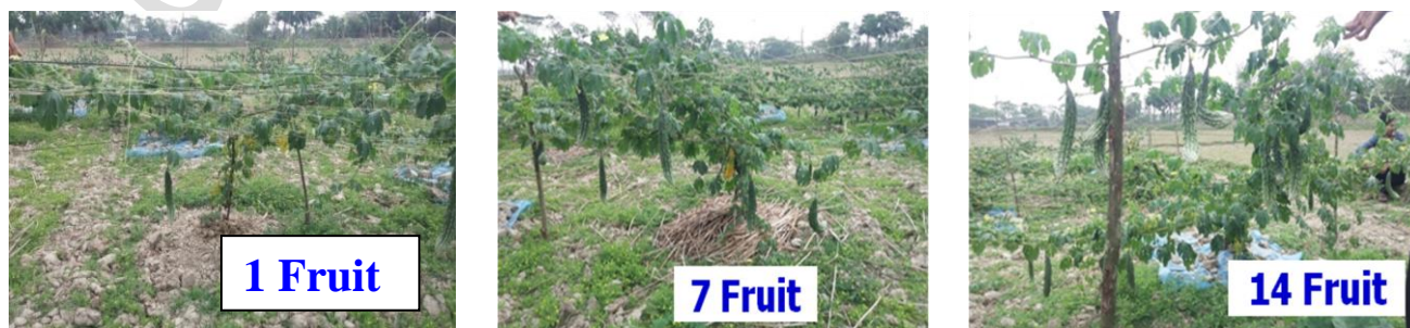
Fig. 1: Effect of mulching and K fertilization on number of fruits per plant at the time of first harvesting.

The number of fruits per plant varied significantly due to the single effect of mulch materials, K fertilizer and their interactions in both the years (2017-18 and 2018-19). Considering single effect of mulch, the highest number of fruits per plant of 18.0 and 15.0 was obtained from polythene mulch in first and second year, respectively which was significantly higher than the rice straw mulch treatment. The lowest number of fruits per plant of 7.0 and 8.0 was recorded in no mulch treatment in first and second year, respectively. Considering single effect of K fertilizer, the highest number of fruits per plant of 15.0 and 14.0 was obtained from 150% recommended K treatment in first and second year, respectively. In case of interaction effect, the highest number of fruits per plant of 23.0 and 19.0 was recorded in polythene mulch \times 150% recommended K fertilizer interaction in first and second year, respectively. The polythene mulch \times 100% recommended K had the second rank on this parameter. Both the years and locations no mulch \times no K fertilizer interaction had the lowest performance (Table 2).