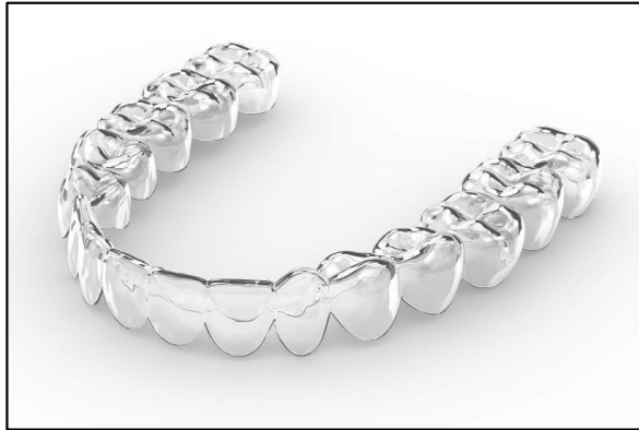
Figure 2: Transparent clear aligner material