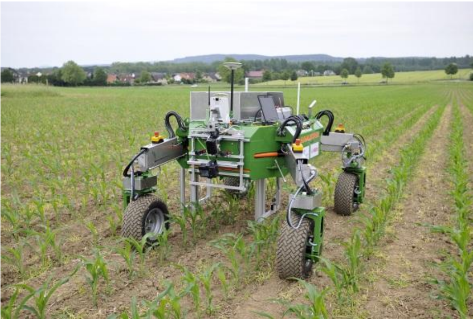
Figure 3:- Agriculture Robotics and Automation