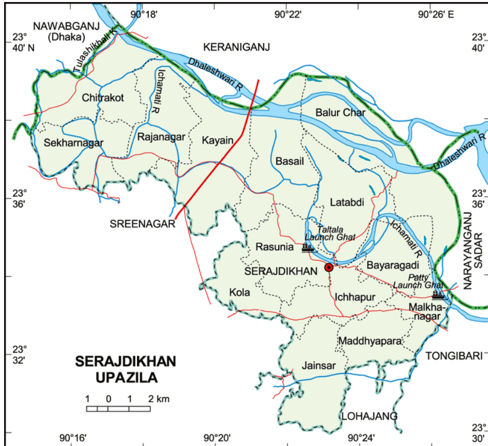
Fig 1: Map of Serajdikhan Upazila

the south, Louhjong and Srinagar Upazilas; and on the west, Nawabganj and Srinagar Upazilas. The land area of the Upazila is 172.51 sq km, while the river area is 7.54 sq km, totaling 180.19 sq km. There are 288107 people in total, with 143559 men and 144547 women.