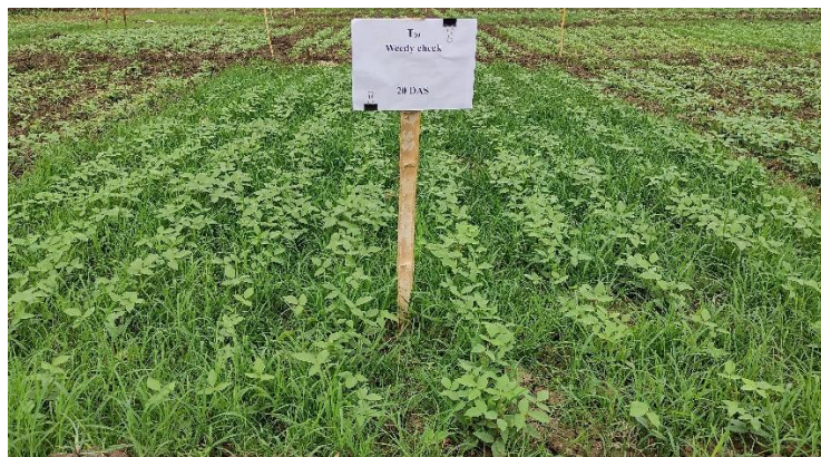
Fig 4. T 10 -Weedy check