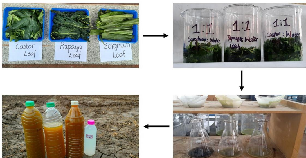
Fig 2. Preparation of leaf extracts

PE- Pre- Emergence application; DAS- Days after sowing; fb - followed by