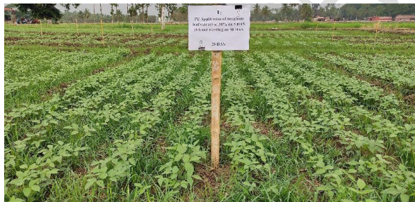
Fig 3. T 1 - PE Application of Sorghum leaf extract @ 30%