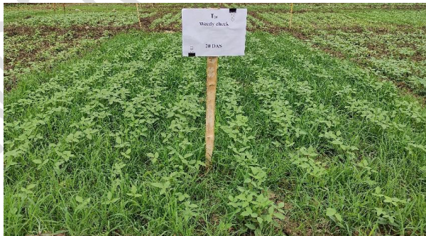
Fig 4. T 10 -Weedy check