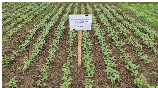
Fig 5. T 7 - Hand weeding twice on 15 DAS and 30 DAS