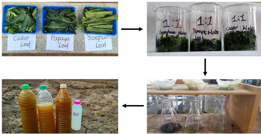
Fig 2. Preparation of leaf extracts