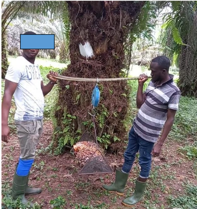
Fig 1: Technique for weighing bunches per tree

DE : Deli ; ANG : Angola ; LM : La Mé ; YO : Yocoboué ; (T1*) : Control 1 DA 10 D x LM 2 T ; (T2*) : Control 2 : LM 2 T x D A115 D ; (T3*) : Control 3 (LM5T x LM 10 T) x (LM 630 D x TNR 115)