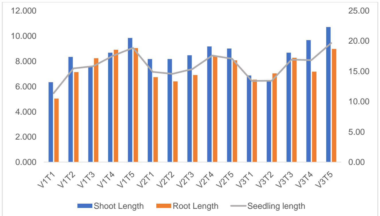
Fig 2: Impact of priming with UV radiation on shoot length, root length and seedling length.