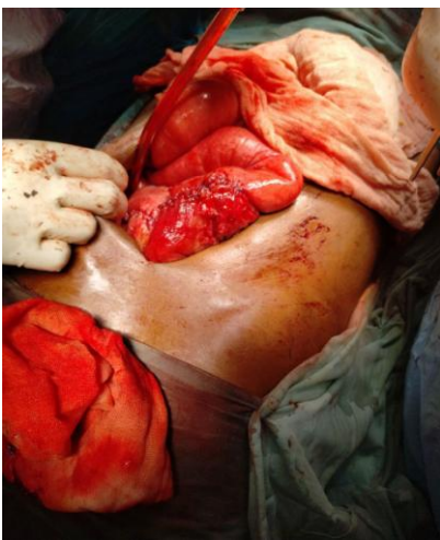
Fig 2: Dissection during Laparotomy

An antrocolicisoperistalticgastrojejunostomy was done. The post-operative period was uneventful. The patient was started on oral feeding on day 4. Drains were removed on post-operative day 5. Stitches were removed on day 10. The patient was discharged uneventfully.