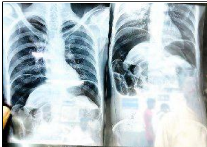
Fig 1: X-ray: Gas under Diaphragm

The patient underwent an emergency laparotomy, and a perforation of size 4x4 cm was present over the anterior surface of the stomach. Also, the transverse colon passed below the stomach with small bowels to the right. The fourth part of the duodenum and the duodenojejunal junction were not present.