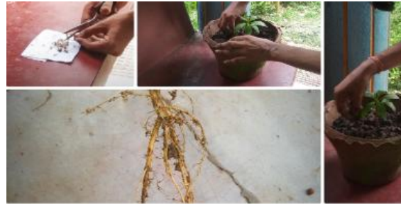
Plate.2 Nematode collection from Root knot of okra.