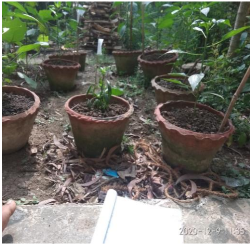
Plate:3. Recording data

Root-knot and root-rot estimation: The galls produced by root-knot nematode ( Meloidogyne incognita ) were estimated by counting the number of galls per root system 15, 30, 45, 60, 75, 90, days after sowing (James, 1996).