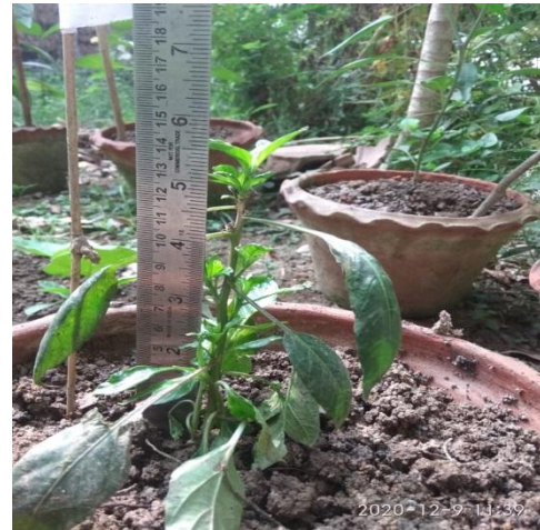
Plate: 4. Measurement of plant height