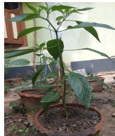
Plate 6: Growth of plant