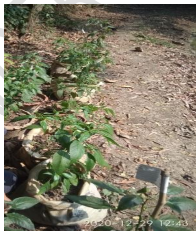
Plate.5 Number of leaves counted per plant.