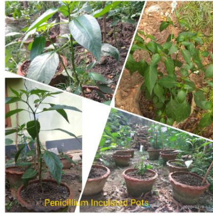
Plate.8 Growth pattern of chilli is vigorous in only penicillium inoculated pots.