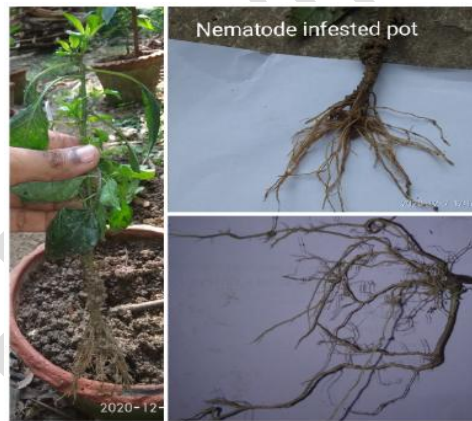
Plate10 three small root knot seen in root of chilli root.