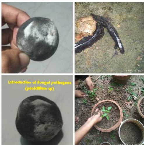
Plate.1 Fungus collection.

T4= Inoculated with Penicillium sp and Meloidogyne incognita