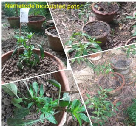
Plate.9 Nematode Inoculated pots