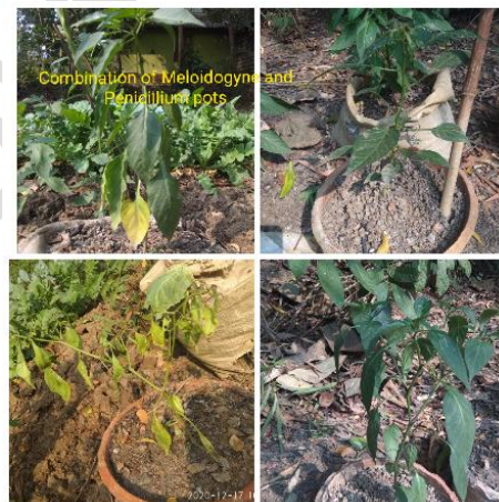
Plate.11 Both Penicillium and Meloidogyn mixture pots.