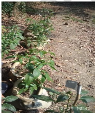
Plate.5 Number of leaves counted per plant.