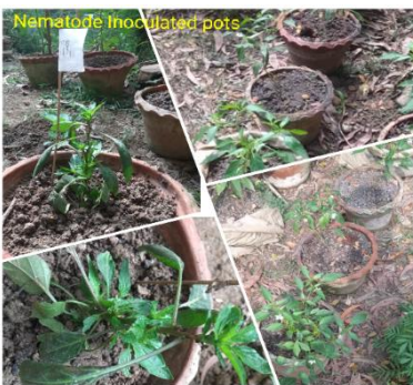
Plate.7 various Insect infestation seen in control plot.