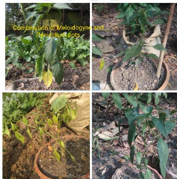
Plate.11 Both Penicillium and Meloidogyn mixture pots.