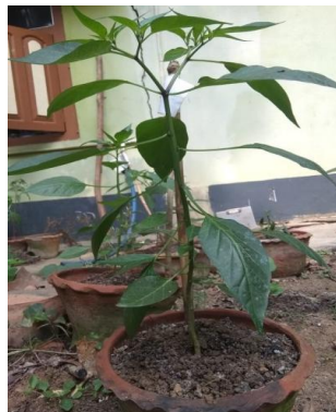
Plate 6: Growth of plant