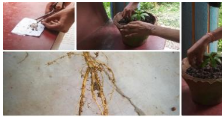
Plate.2 Nematode collection from Root knot of okra.