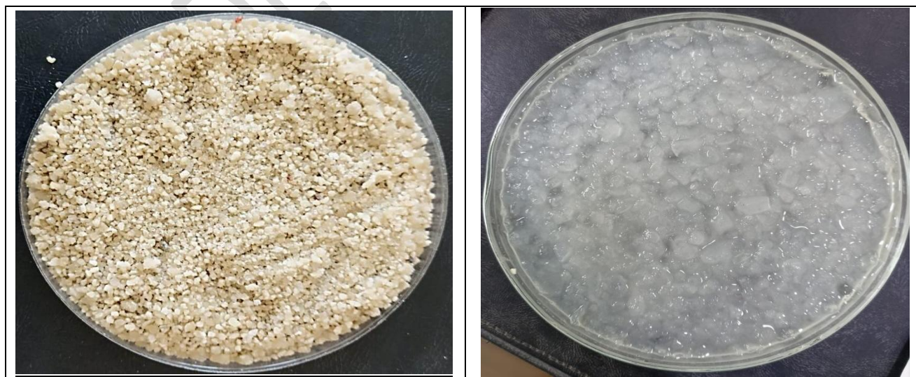
Fig(1): Hydrogel polymer before and after water absorption.