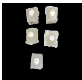
Figure:1: Tooth blocks made to assess the fracture resistance.