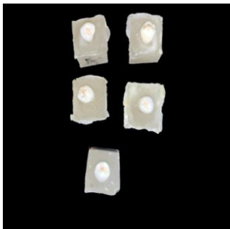
Figure:1: Tooth blocks made to assess the fracture resistance.

Pre operative radiographs were taken. Access cavity preparation was done with endo access bur and access refinement was done with endo z bur. We used Neo Endo blue rotary files which was an assorted pack of both 4% and 6% files. A Woodpecker E-com plus endo motor was used. Orifice enlargement followed by a glide path file. Cleaning and shaping with the working length of the tooth was started in which 5 samples cleaning and shaping was done with 4% rotary files and other 5 were 6% rotary files from the assorted pack. Obturation of the root canal was done with 4% and 6% gutta percha respectively. The Gutta Percha was sheared till the cementoenamel junction and entrance filling was done with the help of composite. Resin blocks were made with the root canal treated premolars (fig:1).