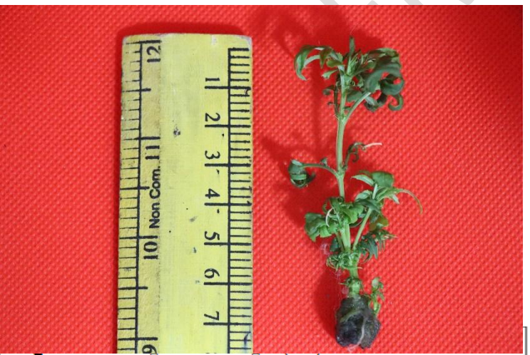
supplemented with BAP 1mg/L + NAA 0.05mg/L + GA 3 0.5mg/L.