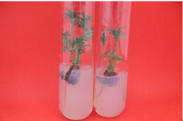
Figure III Number of shoots per nodal segment in media supplemented with BAP 1mg/L + NAA 0.05mg/L + GA 3 0.5mg/L.