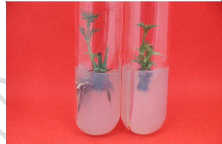
Figure IV Number of shoots per nodal segment in media supplemented with BAP 1mg/L + NAA 0.1mg/L + TDZ 0.5mg/L