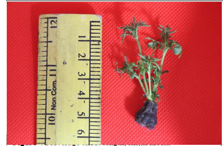
supplemented with BAP 1mg/L + NAA 0.1mg/L + TDZ 0.5mg/L.