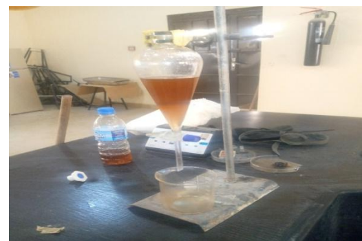
PICTURES TAKEN DURING THE RESEARCH PROCESS AT CHEMISTRY LABORATORY FEDERAL UNIVERSITY DUTSE, JIGAWA STATE, NIGERIA.