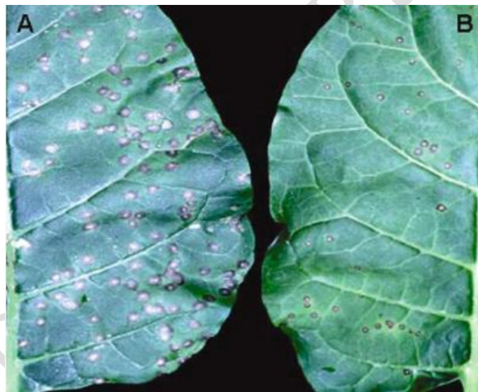
Figure 2. Representation of tobacco leaves ( Nicotiana tabacum ) inoculated with tobacco mosaic virus (TMV). A) Leaves treated with control solution containing only water. B) Leaves treated with seaweed extract.

In studies carried out by Gonzalez et al. [6], biostimulant compounds based on growth-promoting mycorrhizal fungi (AMF) and seaweed extract (SE) were used, which regulate or improve the physiological processes of plants in physiological characteristics related to growth and biochemical effect on protein contents, lipids, carbohydrates, nitrogen and phosphorus from tomato plants ( Solanum lycopersicum L. cv "Rio Fuego"). Thus, the treatments were tested: only the nutrient solution (NS); AMF; AMF+NS; SE; SE+NS; AMF+SE+NS.