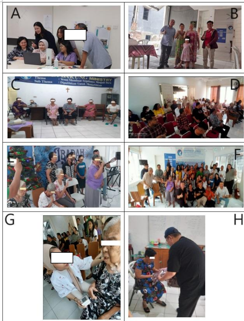
Figure 2. Social activity (consists of five different visits) conducted to the inmates of a nonprofit nursing house which accommodates 12 abandoned elderlies which previously living alone without any family. (A) Preparation meeting, (B) first visit and FGD with the management, (C) second visit and FGD with the inmates, (D-F) third visit, (G) blood pressure measurement during the programme, (H) fifth visit

Small everyday gestures such as a tap on the shoulder can affect the way humans feel and act [21]. Human touch reduced heart rate and lowers blood pressure [22] as well as cortisol [23]. It also triggers the release of oxytocin [24], a hormone known for promoting emotional connectedness or bonding to others. Sincere human touch can have a calming effect and alter the way stress is handled, thereby promoting mental and physical health. Warm, friendly touches of appreciation make others feel esteemed, valued and good. Even in the era of intelligent robots in households and healthcare, recent research also addressed the potency of robotic touch for stress reduction [21]. Under suitable and appropriate circumstances, touch may act as strong social non-verbal tools (more than just a signal) for safety, trustworthy and solidarity [25].