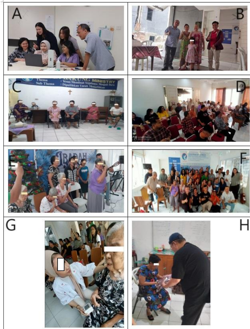
Figure 2. Social activity (consists of five different visits) conducted to the inmates of a nonprofit nursing house which accommodates 12 abandoned elderlies which previously living alone without any family. (A) Preparation meeting, (B) first visit and FGD with the management, (C) second visit and FGD with the inmates, (D-F) third visit, (G) blood pressure measurement during the programme, (H) fifth visit

Small everyday gestures such as a tap on the shoulder can affect the way humans feel and act [21]. Human touch reduced heart rate and lowers blood pressure [22] as well as cortisol [23]. It also triggers the release of oxytocin [24], a hormone known for promoting emotional connectedness or bonding to others. Sincere human touch can have a calming effect and alter the way stress is handled, thereby promoting mental and physical health. Warm, friendly touches of appreciation make others feel esteemed, valued and good. Even in the era of intelligent robots in households and healthcare, recent research also addressed the potency of robotic touch for stress reduction [21]. Under suitable and appropriate circumstances, touch may act as strong social non-verbal tools (more than just a signal) for safety, trustworthy and solidarity [25].