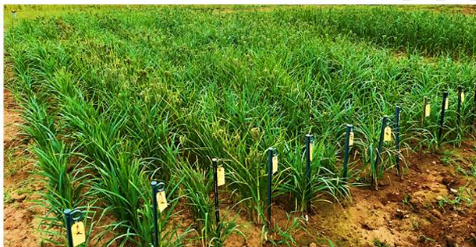
Fig.1. Control plots at reproductive stage of 20 finger millet genotypes during

sowing. During layout, small bunds were provided all around each plot and between irrigation channels and the land within each individual plot was leveled manually to maintain uniform irrigation water application. The recommended dose of 50:40:25 N, P 2 O 5 , K 2 O kg ha -1 was applied in split dose. NPK was applied in the form of urea, di-ammonium phosphate and muriate of potash, respectively. Half of the recommended dose of nitrogen and full dose of P and K was given as basal dose at the time of transplanting and the remaining 50 per cent N (urea) was provided as top dressing at 35-40 DAS. Irrigation was provided to the control plots (No stress plots) at regular intervals of once in 3 days to maintain the adequate field capacity so as to maintain the crop without any stress. For induction of stress to the plots at reproduction stage moisture was withheld for 15 days. The crop was harvested at maturity as the ear heads turned brownish colour coupled with straw turned to yellowish colour to ground level separately and dried for a week before recording the weight. The grains were cleaned, dried and weight was recorded at less than ten per cent moisture content and finally values were converted to per hectare basis.