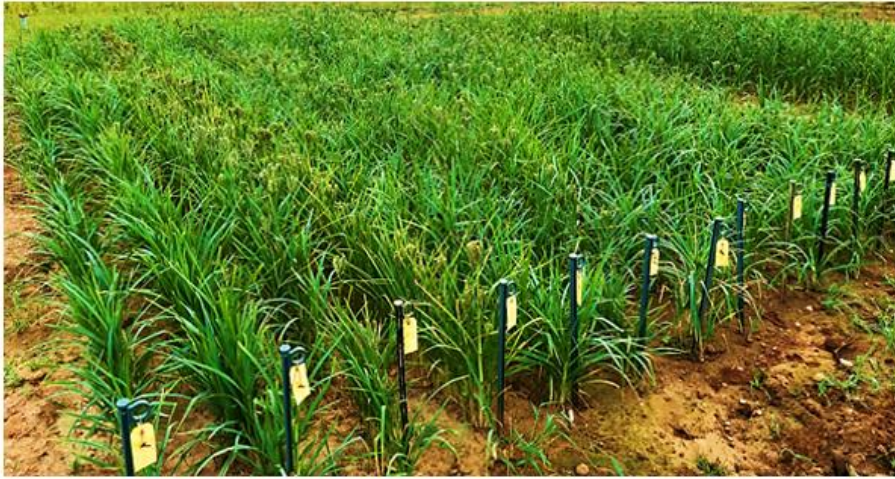
Fig.1. Control plots at reproductive stage of 20 finger millet genotypes during preliminary screening