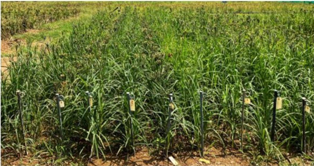
Fig.2. Water stress imposed plots at reproductive stage of 20 finger millet genotypes during preliminary screening