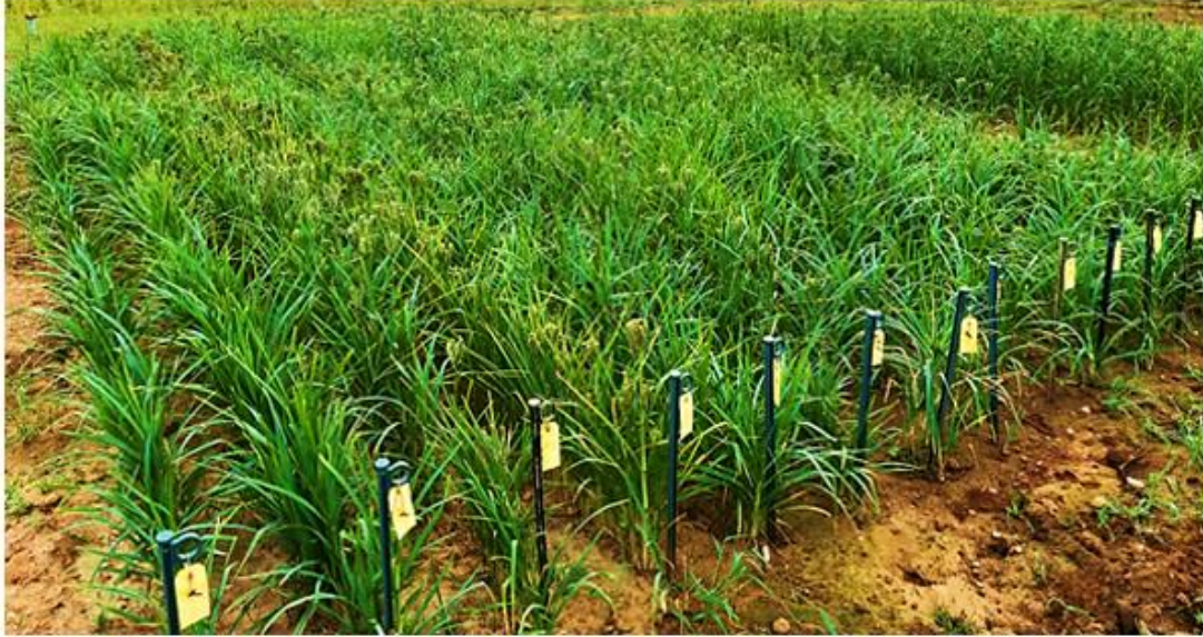
Fig.1. Control plots at reproductive stage of 20 finger millet genotypes during preliminary screening