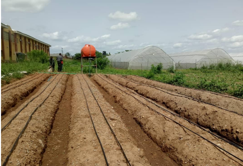
Plate 2: Experimental site showing the ridges and the drip lines: in the open-field