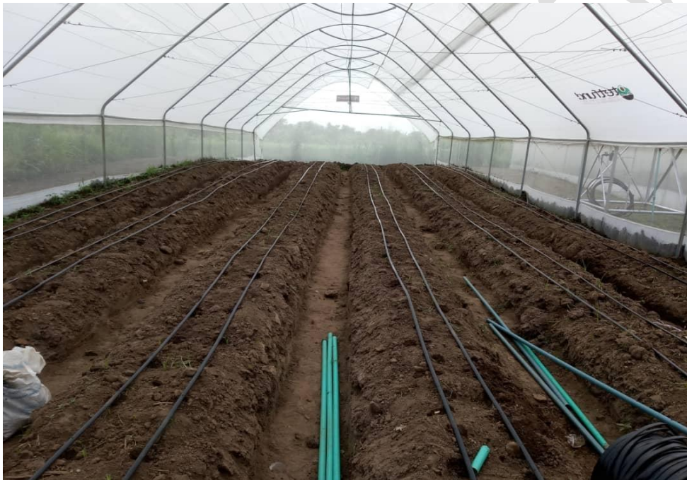
Plate 1: Experimental site showing the ridges and the drip lines: in the open-field

The irrigation was layout with two rows in a block. There was six (6) blocks and each block contained three (3) experimental units. The installation of flow meter was carried out on the delivery pipe to accurately measure the volume of water supplied to the field. The flow meter was validated for confirmation of its accuracy. The laterals was spaced at 40 cm with an emitter spacing of 30 cm shown in Plates 1 and 2 . The spacing of the pepper therefore was 40 cm x 30 cm. Drip irrigation system was used in irrigating as well as fertigating the green pepper in poly-hose and open-field. Same lateral line which was used in the poly-house was used in the open-field and control valve was provided for each drip line to regulate the flow of required quantity of water supplied to each plot.